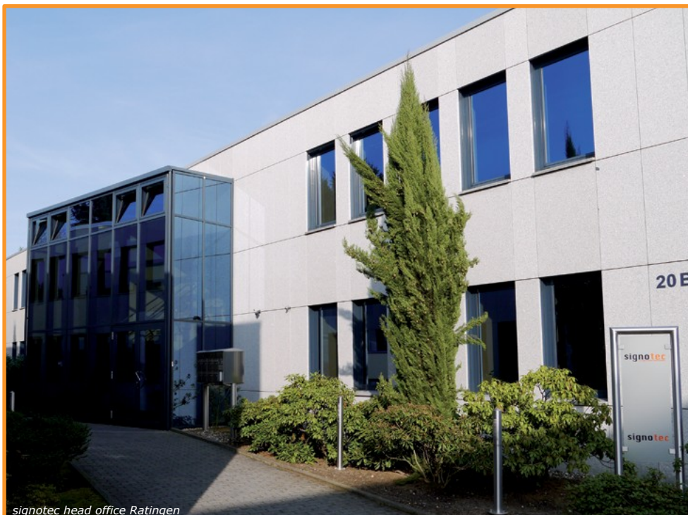
signotec head office Ratingen

All rights reserved! This documentation and the components described therein are copyrighted products of the signotec GmbH Ratingen in Germany.